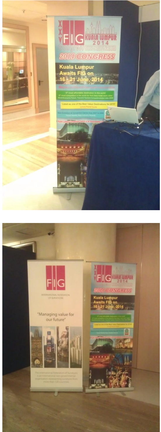
a booth of the FIG Congress 2014 Malaysia

for the official institutions: FIG WW 2013 Abuja – Nigeria, FIG, New Zealand Institute of Surveyors, CNGeGL, 8th FIG Regional Conference in Uruguay, FIG Congress 2014 Malaysia.