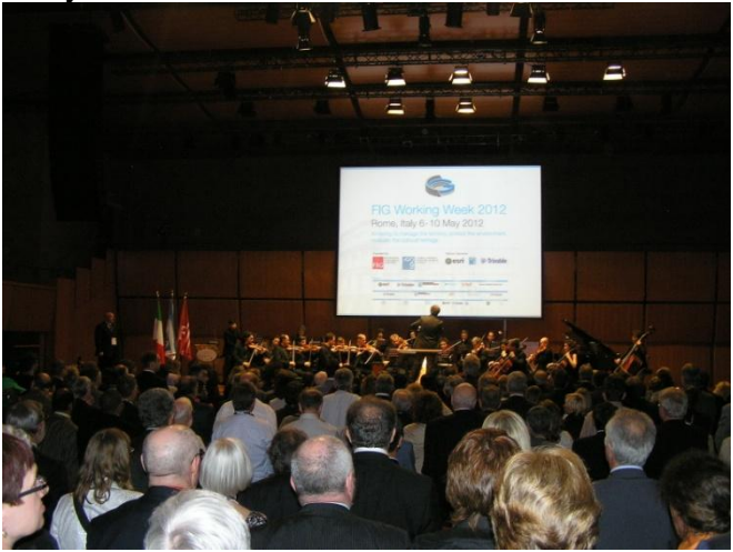
Concert in the Parco della Musica

The working week included in itself official events like "Opening reception" with concert and cocktail in the Parco della Musica with speeches by VIP guests as well as a greeting by the Mayor of Rome.