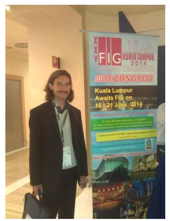
in front of the booth of the FIG Congress 2014 Malaysia

FIG Commission 5 had a plenary session on 6-th of May, where were discussed the forthcoming international events as well as questions from the members of the Commission. The last had a number of presentations in 17 sections, separated in 3 days from the working week. A major role had the presentations, dealing with the laser scanners. The presentations were split into 3 sessions, underlining their big importance and role in the geodetic science and practice nowadays.