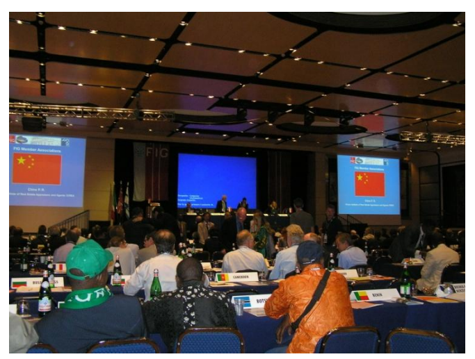
moment from the General Assembly

The forthcoming Regional Conference in Uruguay was presented – November 2012 under the headline "Surveying towards Sustainable Development".